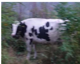
On the way we will stop and meet Mabel and Matilda and hear their chimes firsthand!

Then we will descend the valley to Maso Naranch for a spritz, tasting of some TAAAK amaro, Solaris sparkling wine and an incredible view of the Lago di garda.